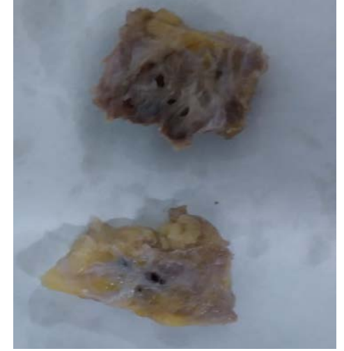
Figure 1: Gross picture showing tan brown lesion with cystic spaces

Based on the above-mentioned findings provisional diagnosis of bursal cyst was made. Elective surgical excision of the swelling was done in the surgical and the specimen was sent to Histopathology department of Azra Naheed Medical College. Gross examination of the specimen revealed a tan brown soft cystic piece of tissue measuring 3.5x3x1cm. Cut surface was tan brown with small cystic spaces. Representative sections were taken and routine histopathological processing was done. Microscopic examination of hematoxylin and eosin stained sections revealed fragments of synovial membrane, hyalinized fibrous tissue comprising of a lesion having admixture of variable sized blood vessels and capillaries mostly arranged in lobular pattern. Thus, the histopathological diagnosis of synovial hemangioma was made.