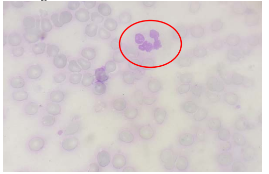
Figure 1 - Hypersegmented Neutrophil

She was a premature baby, born at 35^{th} week of gestation. However, her post-natal history was uneventful. There was history of maternal anemia during pregnancy as the mother was G_5P_4 . The patient had two previous admissions in hospital due to pneumonia when she was only 2 weeks old. However, she got transfused for the first time at two and a half months of age.