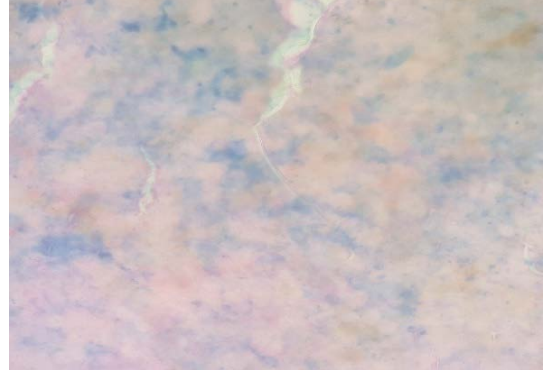
Figure 4–Increased Iron

Myeloid series was active and megakaryocytes were adequate. There were no atypical cells. M:E ratio was 4:1. Her iron stores were markedly increased but occasional siderocytes and sideroblasts were seen which ruled out sideroblastic Anemia (Figure4). There was only 4% dysplasia in erythroid series. Hence final diagnosis of congenital megaloblastic anemia was made. Since patient was already transfused, her folate and Vitamin B12 levels were not done. Maternal vitamin B12 level was 150pg/mL, whereas normal B12 level in adults range from 239pg/mL - 931pg/mL. So, mother was found to be B12 deficient. Maternal folate level was 1ng/mL. Unfortunately, before start of specific treatment, the patient expired. This case is described due to its rarity and importance of early diagnosis and immediate intervention.