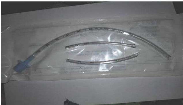
Figure-3: Number-5 non cuff endotracheal tube and two tubes carved from it