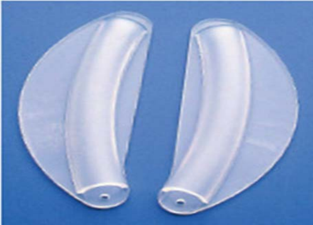
Fig.2: Commercially available Silicone nasal septal splints with airway