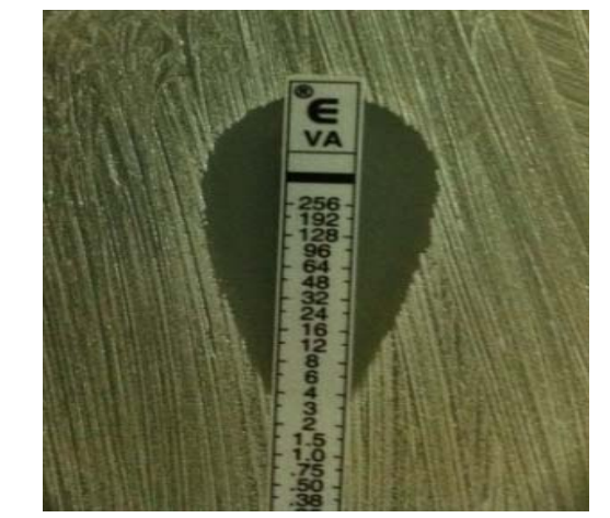
Figure 1: Vancomycin E-Test showing MIC (4µg/ml) in the Range of Vancomycin Intermediate Resistant Staphylococcus aureus (VISA)